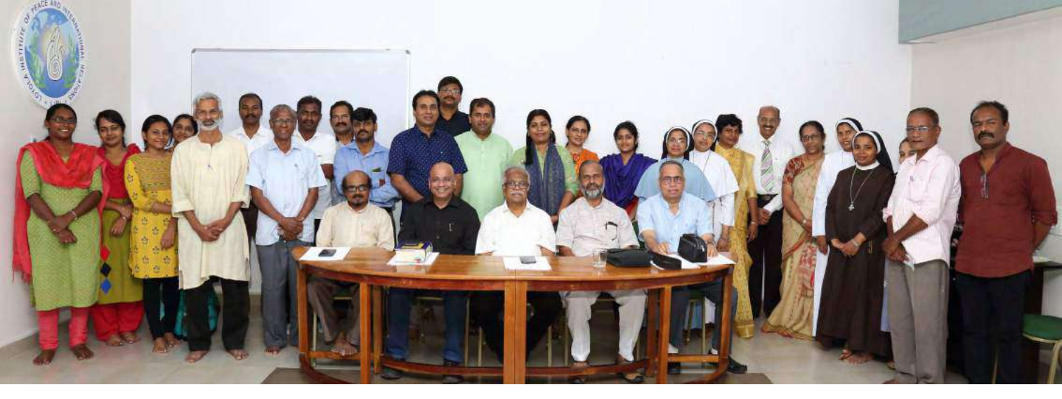
The Certificate program organized by LIPI in collaboration with XLRI- Jamshedpur (26 October 2019 to 11 January 2020)

The programme equips the candidates with practical skills on risk analysis, negotiation, mediation, conference diplomacy, peace-making etc. Over and above the candidates will be enhanced with improved interpersonal relations, better teamwork, deepened social and self awareness, and increased gender sensitivity resulting in all round harmony, peace and justice. The objectives of peace studies are the following: