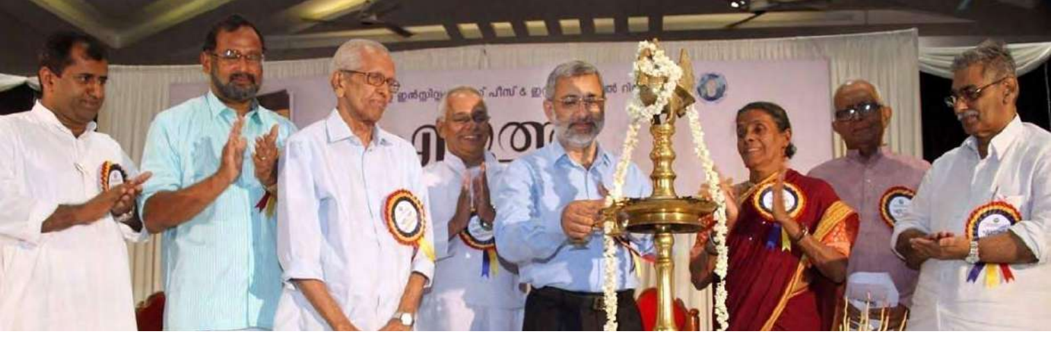
Inauguration of LIPI & Its ActivitiesNov. 1, 2015: Town Hall Ernakulam

its launch. The intellectual, cultural and ethical intervention through Ezhuthu is a prophetic witnessing in the contemporary times.